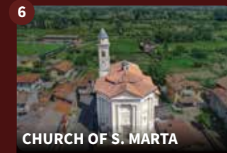
CHURCH OF S. MARTA

On the top of one of the highest hills north of Gattinara, at 540 metres above sea level, are the ruins of the Castle of S. Lorenzo, built in 1187 by the Municipality of Vercelli to guard the Valsesia entry valleys and gradually abandoned between the 16th and 17th centuries. It is one of the best-known vantage points in the city.