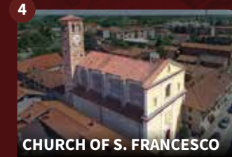
CHURCH OF S. FRANCESCO

The three-nave Romanesque building was demolished around 1470 and a four-nave late Gothic church was rebuilt, whose façade and bell tower base remain today. The church we see today was built in 1881 in neoclassical style. Its dome is among the first Italian constructions in reinforced brick.