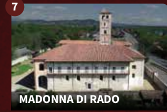
MADONNA DI RADO

In 1619, on the ruins of the Church of San Giulio, work began to build the Church of San Francesco and the convent of the Friars Minor. The church façade of is an example of early, sober Baroque architecture. Inside, stands a beautifully carved wooden altar.