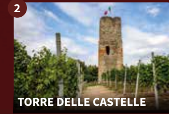
TORRE DELLE CASTELLE

A characteristic late 19th-century building with a magnificent inner courtyard shaded by a centuries-old linden tree, today it is home to the Regional Wine Store, the Eco-museum and hosts an important conference room adjacent to the G'ART exhibition space.