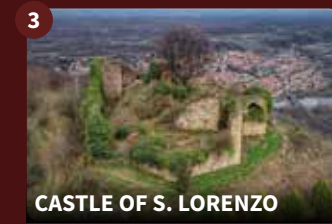
CASTLE OF S. LORENZO

The Eco museum is a dedication to our ancestors and their wonderful farming culture so that it will never be forgotten. It retraces their life and traditions with simple yet curious installations. Three moments of peasant life have been recreated: childhood and school, the kitchen as the heart of family life, and the area that brings together the tools related to working life.