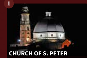
CHURCH OF S. PETER

The three-nave Romanesque building was demolished around 1470 and a four-nave late Gothic church was rebuilt, whose façade and bell tower base remain today. The church we see today was built in 1881 in neoclassical style. Its dome is among the first Italian constructions in reinforced brick.