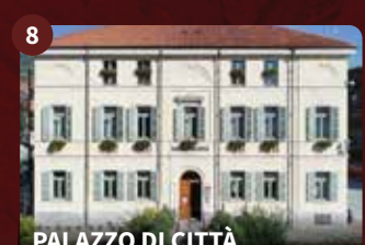
PALAZZO DI CITTÀ

Even before the Borgo was founded in 1242 an ancient monastic cell dedicated to St Benedict existed on the site. Later, the present baroque Church was built, which took the name "Maria Vergine Regina del S.S. Rosario". The façade dates back to 1688. Inside, above a sumptuous black marble altar, is a triptych attributed to Giovenone.