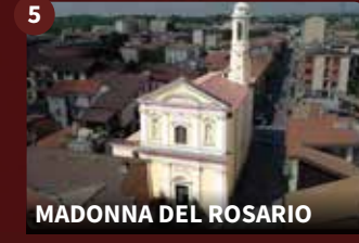
MADONNA DEL ROSARIO

The massive Torre delle Castelle, symbol of the town, dating back to the 11th century, is the most visible part of an important medieval fortified compound. It offers a splendid panorama of the Monte Rosa chain and surrounding area.